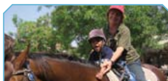
Rehabilitative Horseback Riding